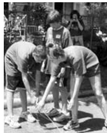
Cascia Hall Students