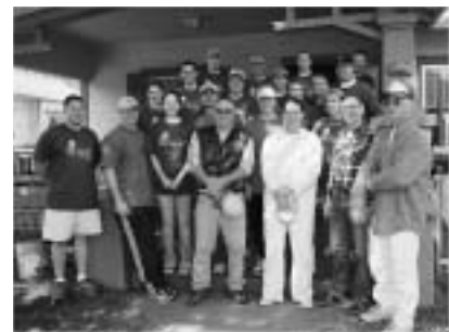
Williams Companies Team