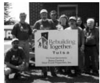
Volunteers from Bama Foods and Clear Creek Properties