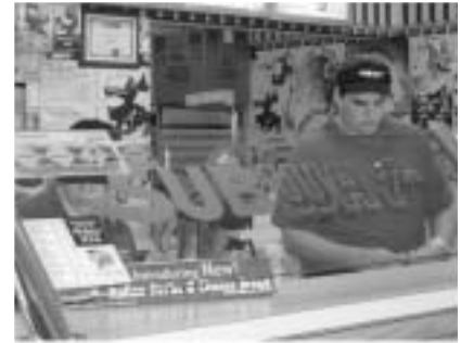
Subway employees prepare lunch for 450 hungry volunteers