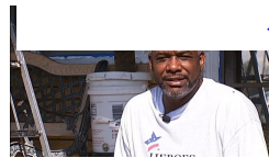
Tottress says his home has needed work for a long time but he just can't do it himself.